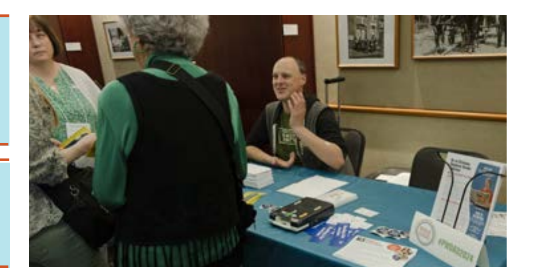
OLBPH staff provides information about our services at PWDAD. >>

Search #PWDAD on Facebook for more insight into the action!